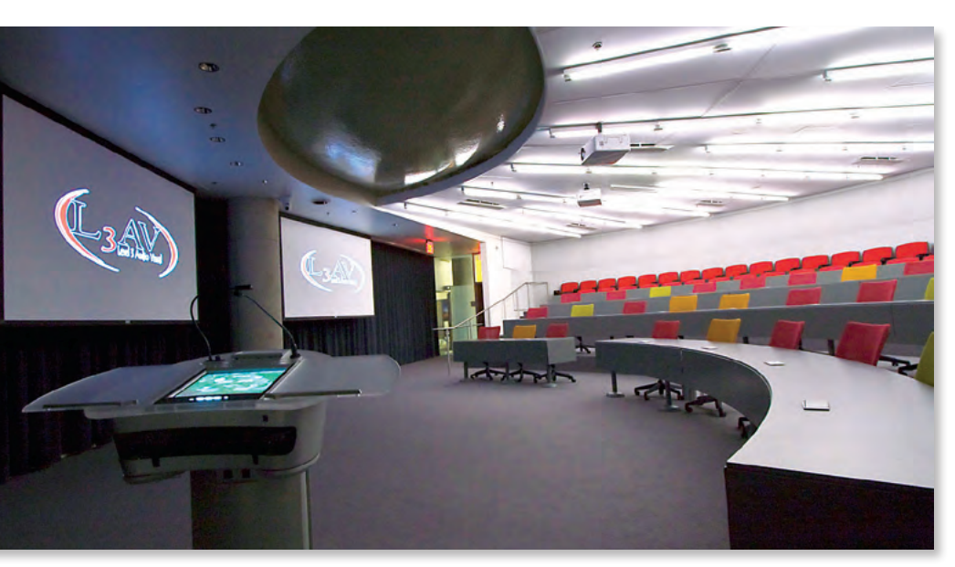
Dial's headquarters building includes a 75-seat training room, which is connected to all other rooms.

Building a new corporate headquarters for a Fortune Global 500 company is no small task. And when that new facility encompasses nearly 350,000 square feet over four floors, an A/V system that seamlessly ties together dozens of conference rooms, boardrooms, and other meeting spaces becomes critical to day to day operations and efficient, effective communication.