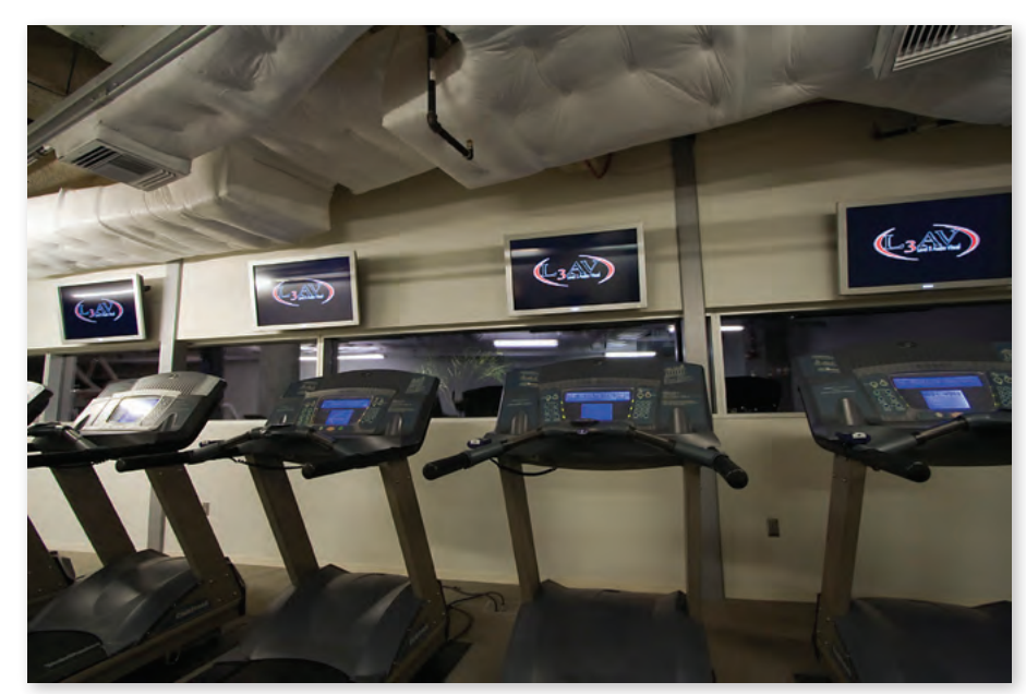
Extron twisted pair products are used to route signals to rooms throughout the building, including meeting rooms, the cafeteria, and even the fitness center.

MTP U R Series Universal Receivers are fully compatible with Extron MTPX and MTPX Plus Series twisted pair matrix switchers and all MTP Series transmitters. The compact units can fit just about anywhere: in equipment racks, under tables, or next to a projector.