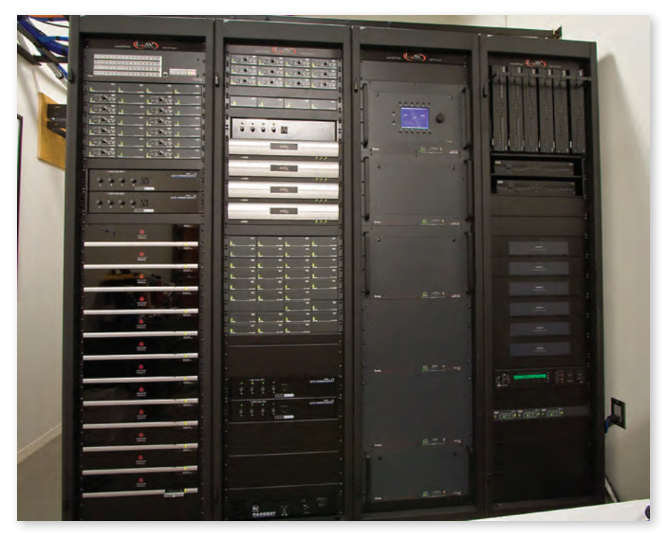
All signals are routed to the central switching room, which houses the twisted pair transmitters and receivers, Matrix 6400 switcher, and the codec farm.

individual room to the headend where the giant router could switch to and from any room, as well as to the codecs," Elsesser says.