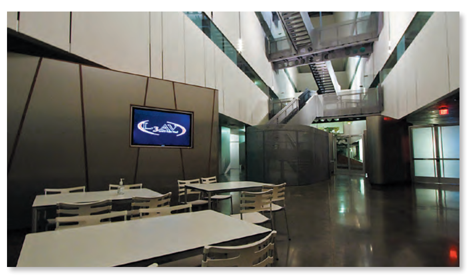
A/V for all conference rooms and common areas is connected to the central switching room so that any signal can go to any or all rooms in the massive building.

"So we used twisted pair to send and receive video and audio signals from each