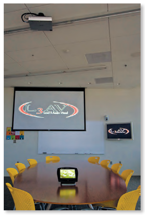
HD videoconference cameras are tied to the central codec farm using MTP series twisted pair transmitters and receivers.

L3AV runs one single feed from each room to the headend. Since each videoconference room has two screens, a projection screen and an LCD, two feeds are run back, with a transmitter and receiver on each end.