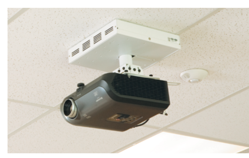
Extron's PoleVault System enables all video switching and audio amplification components to be securely mounted above the projector.

"The PoleVault System addresses the two main sensory complaints from students, which are 'I can't see' and 'I can't hear,'" Tan says. "Before the PoleVault Systems were installed, teachers would put their laptop, projector, and document camera on a cart in the front of the classroom. Sometimes the cart would block the