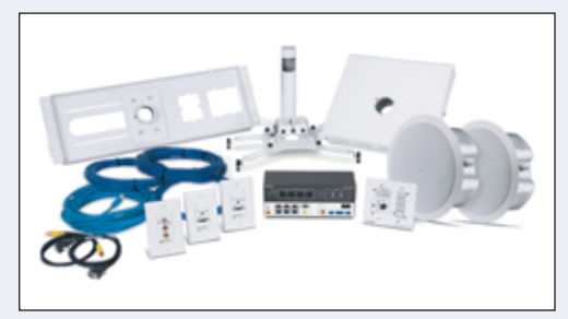
PVS 300 - Three Input System

Extron's PoleVault Systems are complete AV solutions that mount all the switching and audio amplification components securely above the projector. They are easy to install, use, and support, making them ideal for single-projector K-12 classrooms. PoleVault Systems use economical twisted pair cable for transmitting signals, and include network connectivity for Web-based asset management, monitoring, and control. The PoleVault System package includes all the projector control, mounting hardware, switching, amplification, speakers, wallplates, and cabling needed for a complete AV system. All that remains is to add the video sources, projection screen, and projector.