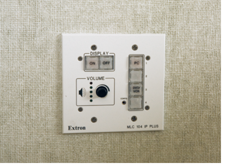
The MediaLink control panel makes it easy to turn the projector on and off, select inputs and adjust the volume.

view of students, and the warmth from the projector exhaust fan was uncomfortable to students sitting near the projector. With the projector mounted on the ceiling, all of that has changed."