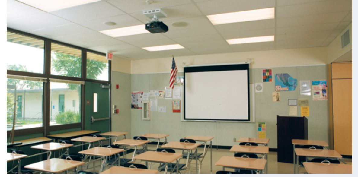
As part of a modernization project, 62 classrooms at Rubidoux High School were equipped with Extron PoleVault Systems.

Extron's GlobalViewer is a free Web-based AV resource management and remote control application that provides a way to manage, monitor, and control projectors, plasmas, monitors, VCRs, DVD players, and other devices using a standard TCP/IP network.