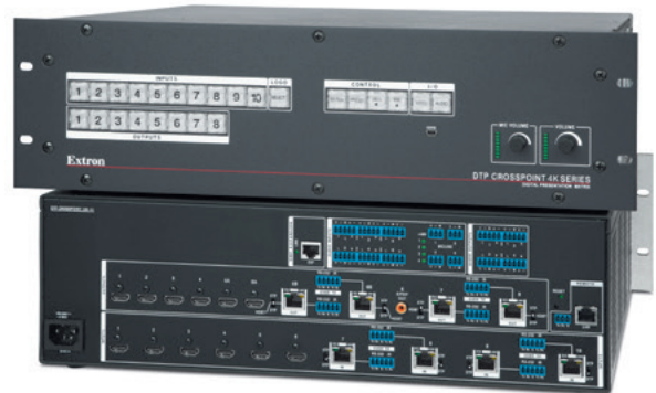
DTP CrossPoint 108 4K 10x8 Seamless 4K Scaling Presentation Matrix Switcher