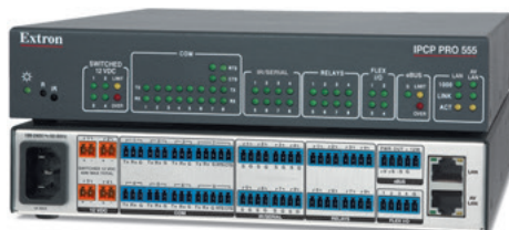
IPCP PRO 555 IP Link Pro Control Processor