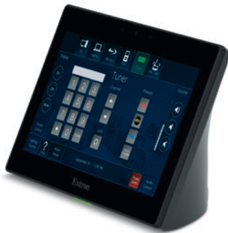
TLP Pro 725T 7" Tabletop Touchpanel