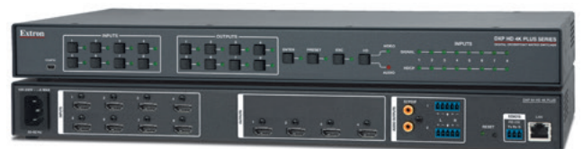
DXP 84 HD 4K 8x4 4K HDMI Matrix Switcher with Audio De-Embedding