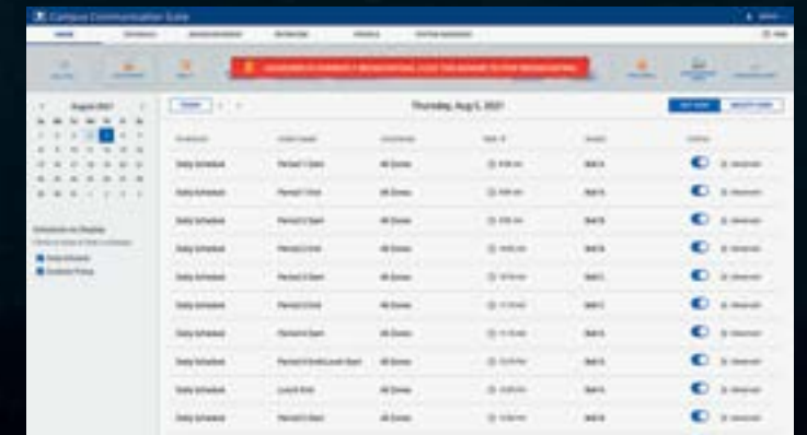
Broadcast in Progress