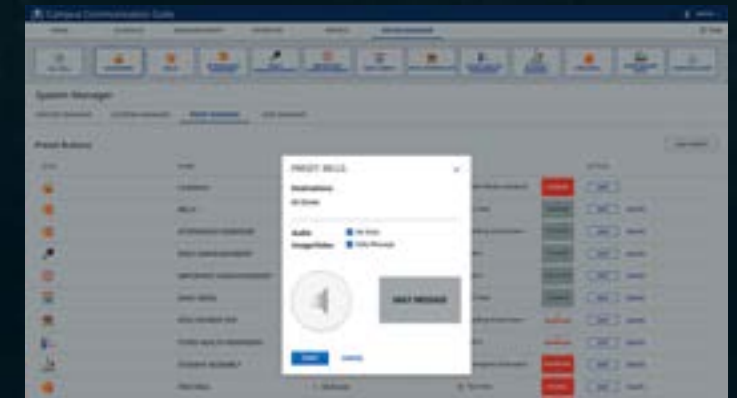
Preset - Daily Bell Schedules