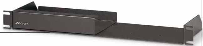
IN9080 Rack Shelf with IN9088B Blank Panel