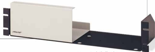
IN9081 Rack Shelf with IN9086 Blank Panel