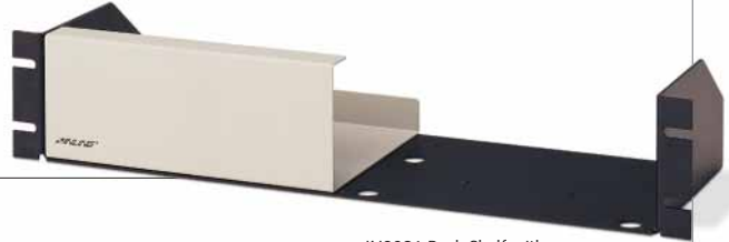
IN9081 Rack Shelf with IN9085 Blank Panel